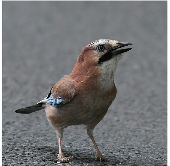
Jay at Seabrook (Brian Harper)

The full species account will follow but the breeding and wintering distribution maps based on the 2007 – 2012 BTO / KOS atlas are provided below.