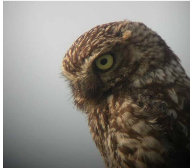
Little Owl at Botolph's Bridge (Ian Roberts)

The full species account will follow but the breeding and wintering distribution maps based on the 2007 – 2012 BTO / KOS atlas are provided below.