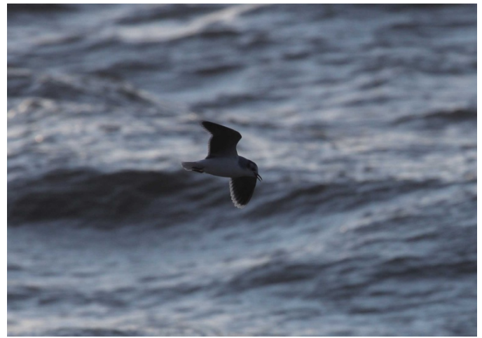
Little Gull at Seabrook (Ian Roberts)

The full species account will follow but the breeding and wintering distribution maps based on the 2007 – 2012 BTO / KOS atlas are provided below.