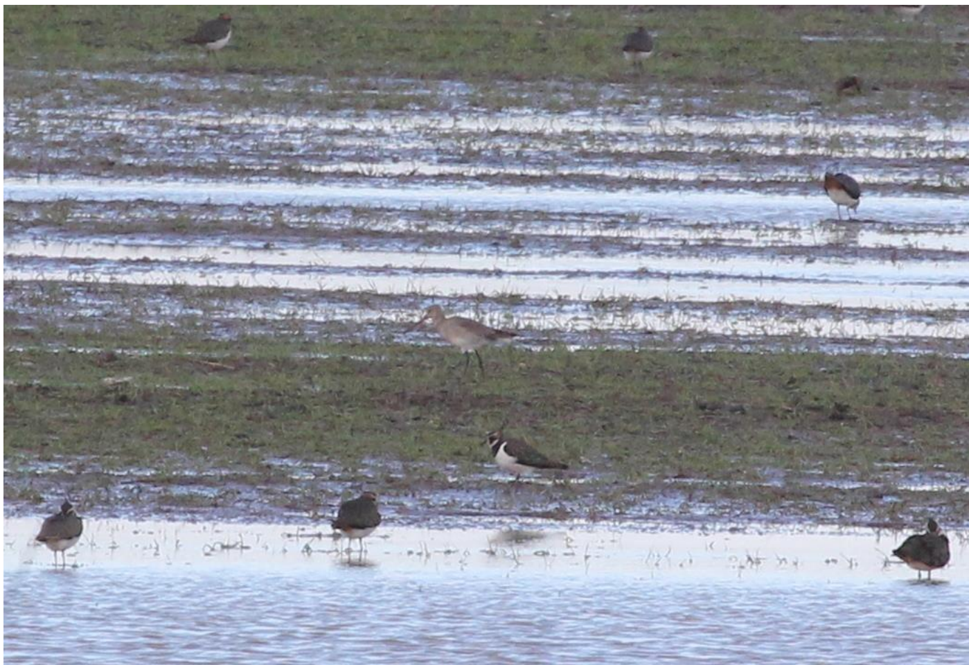
Black-tailed Godwits at the Willop Basin