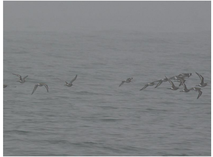
Black-tailed Godwits at Battery Point (Brian Harper)

A passage migrant and winter visitor to Kent. Breeds in small numbers (six pairs with a status of at least possible breeding in 2010, one of which was confirmed).