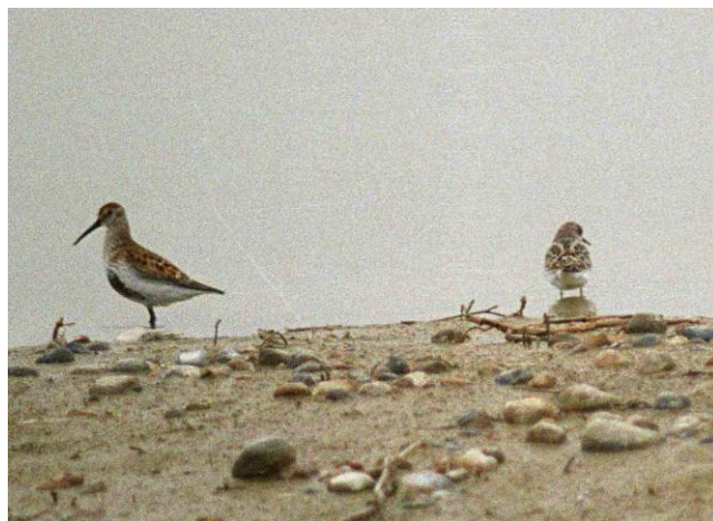
Little Stint with Dunlin at Nickoll's Quarry

A regular passage migrant to Kent, being more numerous in autumn, with a few overwintering in most years. In certain conditions, when easterly winds are prevalent in autumn, large numbers can occur in the county and on the British east coast in general.