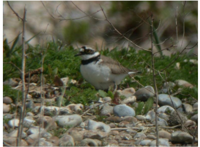
Little Ringed Plover at Nickoll's Quarry (Ian Roberts)

A scarce breeding species in Kent (with 15 confirmed or probable breeding pairs in 2010), and a regular passage migrant.