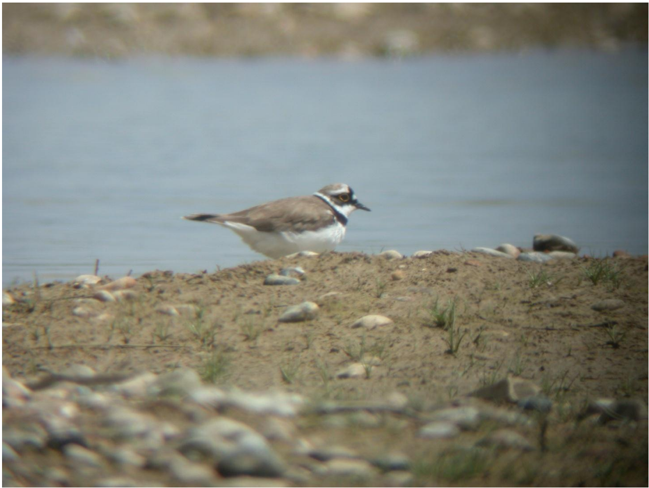
Little Ringed Plover at Nickoll's Quarry