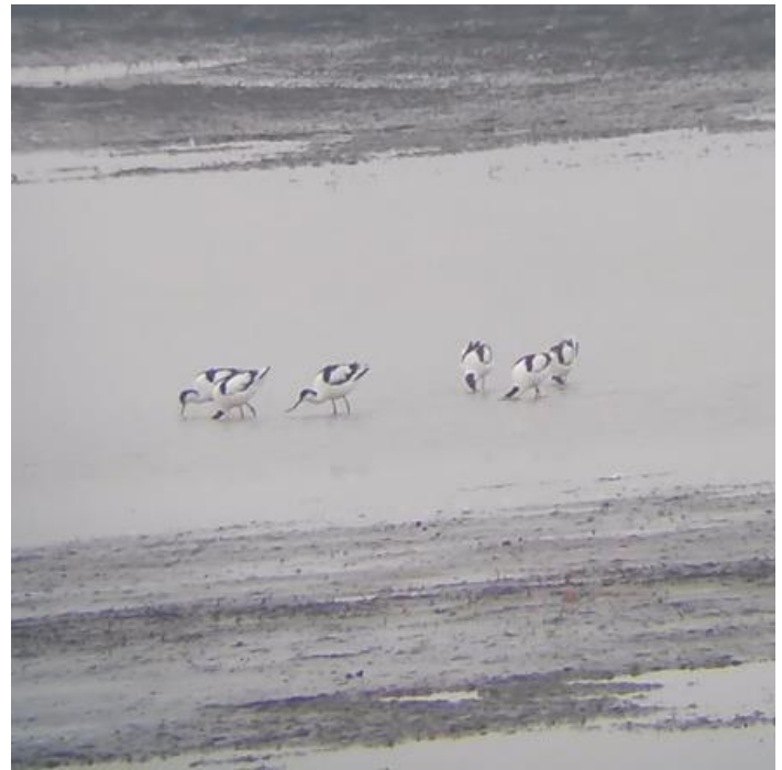
Avocets at the Willop Basin (Brian Harper)

An increasing breeding summer visitor, passage migrant and winter visitor to Kent. The 2010 Rare Breeding Bird Report gave a total of 196 confirmed breeding pairs in the county, across 9 sites.