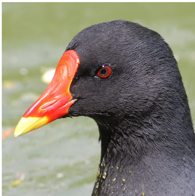
Moorhen at Saltwood Castle (Brian Harper)

The full species account will follow but the breeding and wintering distribution maps based on the 2007 – 2012 BTO / KOS atlas are provided below.