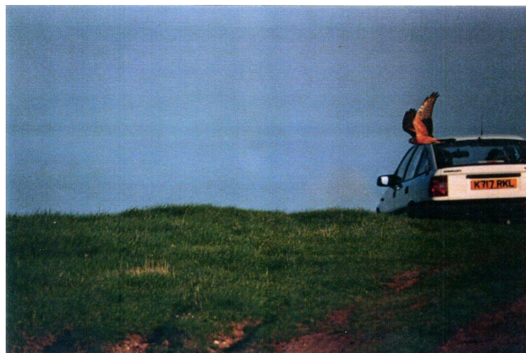
Montagu's Harrier at Abbotscliffe