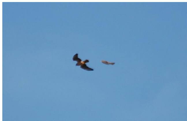
Montagu's Harrier at Samphire Hoe

A scarce but regular passage migrant in Kent, which occasionally summers and has bred in recent years.