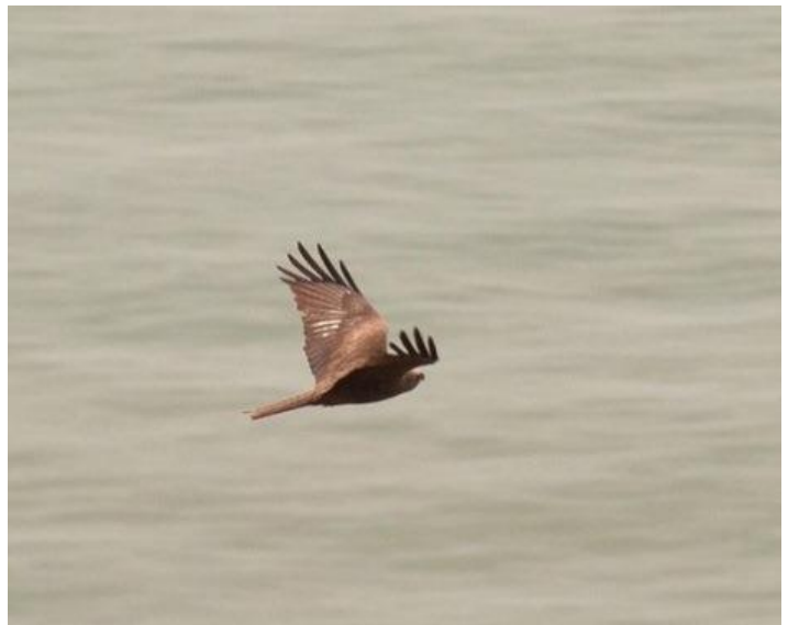
Black Kite at Capel-le-Ferne

First recorded in the Folkestone and Hythe area in 1994, with another the following year, and 11 since 2005, as shown in figure 1. There was more than one record for the first time in 2011 (although two earlier records related to multiple individuals).