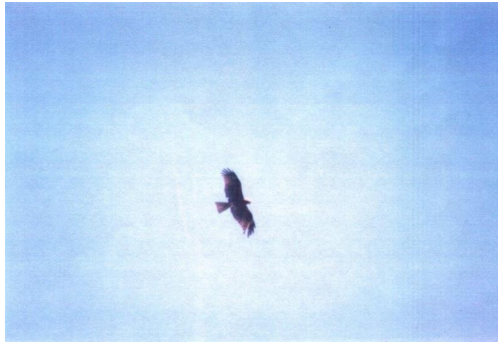
Black Kite at Capel-le-Ferne (Dale Gibson)