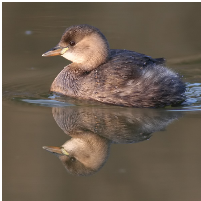
Little Grebe at Botolph's Bridge (Brian Harper)

The full species account will follow but the breeding and wintering distribution maps based on the 2007 – 2012 BTO / KOS atlas are provided below.