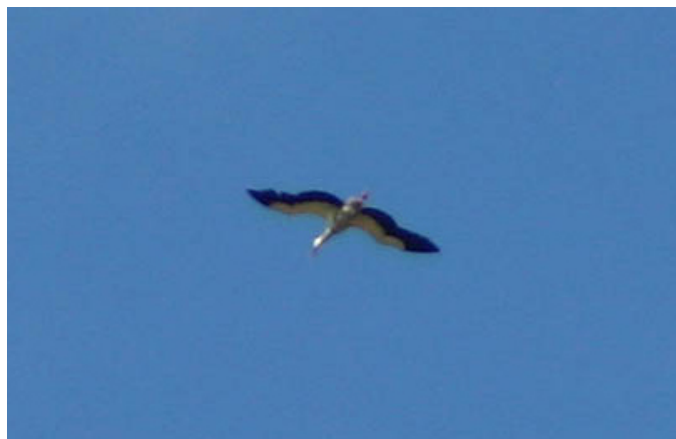
White Stork at Folkestone (Dale Gibson)

Breeds on the continent from Spain, through France, into Germany and beyond into eastern Europe and Russia. Some winter in the southern part of the breeding range but the majority migrate to tropical Africa, Iran or the Indian sub-continent. There has been a significant decrease in the north and west of the European range which has been offset to some extent by reintroduction schemes.