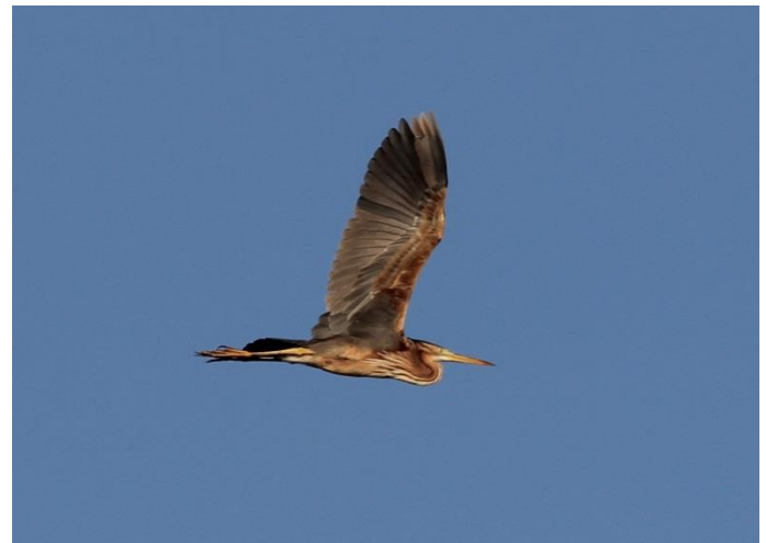
Purple Heron at Nickoll's Quarry

A rare passage migrant to Kent, scarcer in recent years. There were 134 county records to the end of 2010, but only 17 of those were in the last decade. The extreme arrival dates are 27 th March and 13 th November, with April and May accounting for the majority (55%) of records.