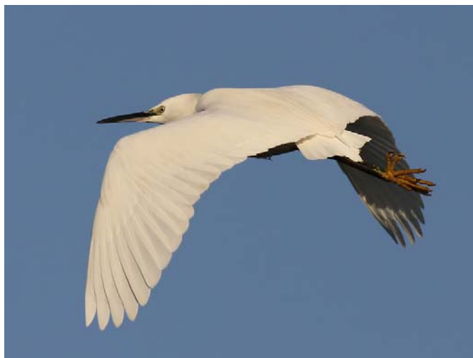
Little Egret at Nickoll’s Quarry (Brian Harper)

The full species account will follow but the breeding and wintering distribution maps based on the 2007 – 2012 BTO / KOS atlas are provided below.