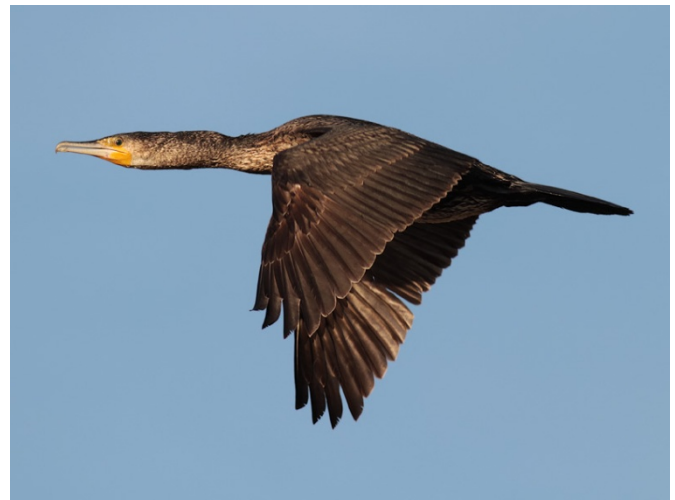
Cormorant at Seabrook (Brian Harper)

The full species account will follow but the breeding and wintering distribution maps based on the 2007 – 2012 BTO / KOS atlas are provided below.