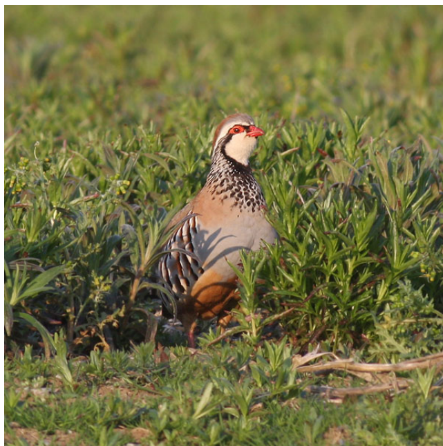
Red-legged Partridge at Botolph's Bridge (Brian Harper)

The full species account will follow but the breeding and wintering distribution maps based on the 2007 – 2012 BTO / KOS atlas are provided below.