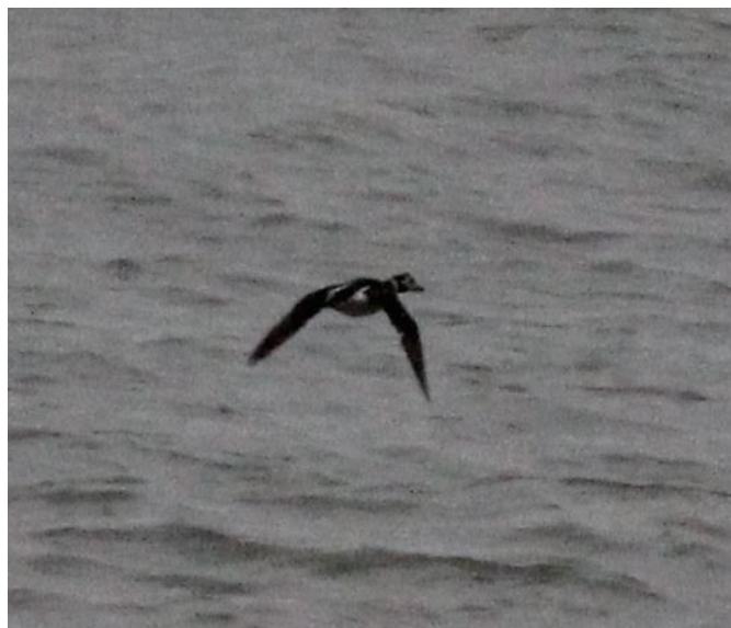
Long-tailed Duck at Samphire Hoe

An uncommon but regular passage migrant and winter visitor in Kent.