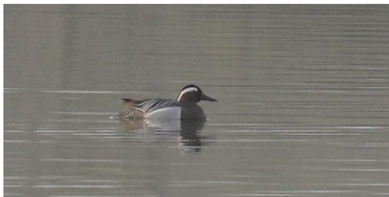
Garganey at Nickolls Quarry