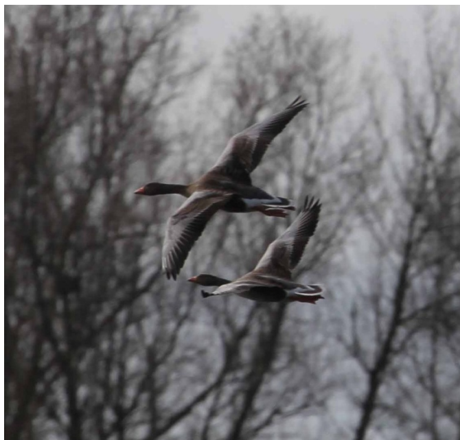
Greylag Geese at Nickoll's Quarry (Ian Roberts)

There is an increasingly widespread feral population within the county. A recent article in British Birds (105: 498-505) proposed that, for conservation management purposes, the remnant native Scottish and more widespread feral populations should be merged to form a new British Greylag Goose population. As a result of recent large increases in the abundance and distribution of both populations, there are now numerous areas where birds of mixed or uncertain provenance occur, making it impractical to continue to treat them as separate populations.