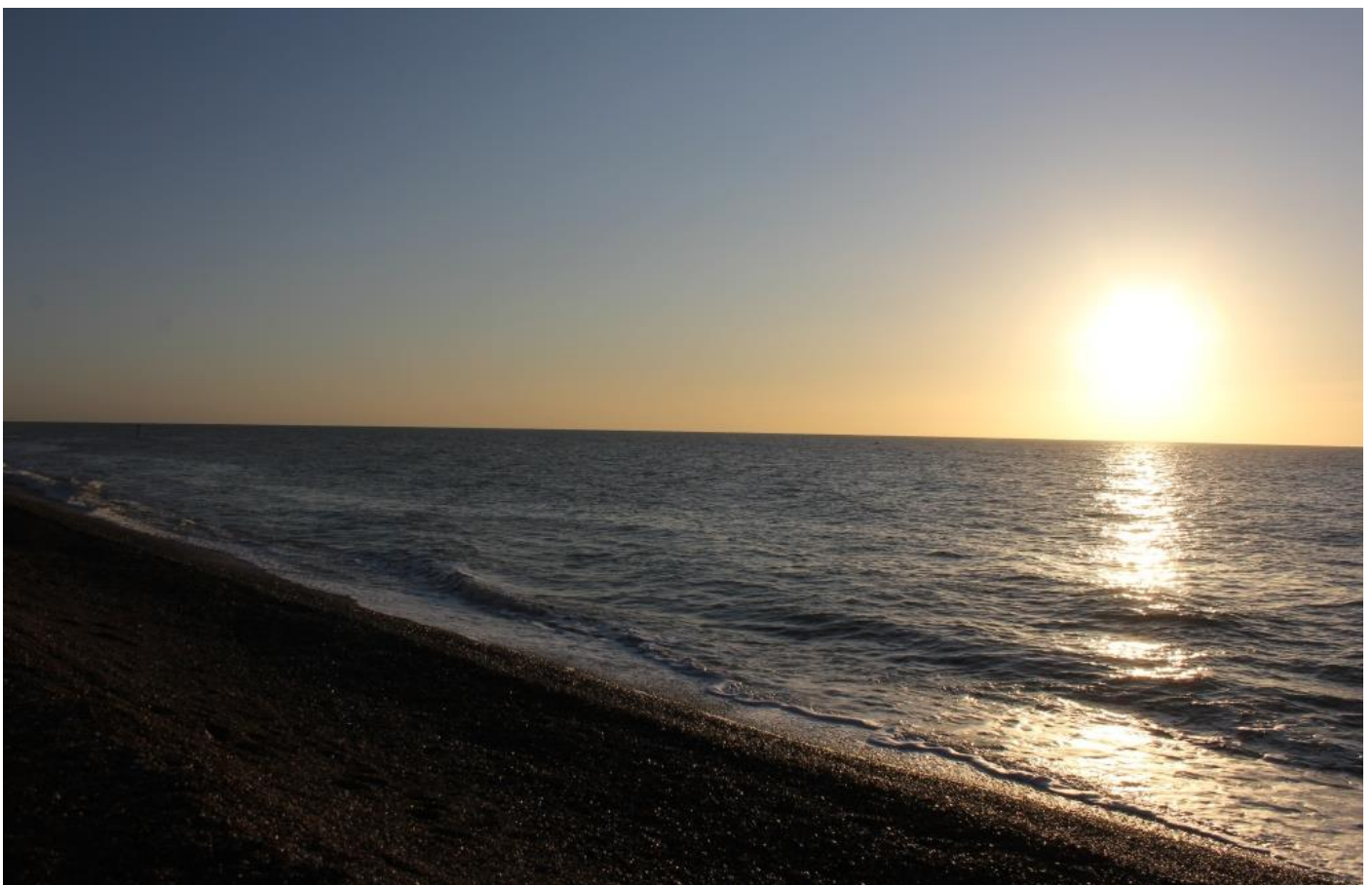
Looking south-east from Hythe Beach

The tetrad can be viewed from the seawall where there is free parking.