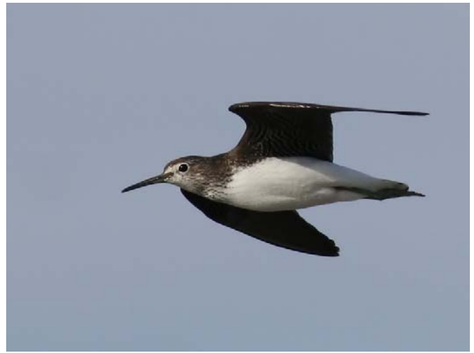
Hoopoe at Samphire Hoe and Green Sandpiper at Botolph's Bridge

A juvenile Red-necked Phalarope was seen from a boat just inshore of Folkestone Pier on the 29 th and a Whinchat, a Reed Warbler, a Lesser Whitethroat, a Chiffchaff, 2 Wheatears and several Whitethroats and Willow Warblers were at Abbotscliffe, where a Marsh Harrier and 3-4 Buzzards flew over, and 20 Sand Martins went west.