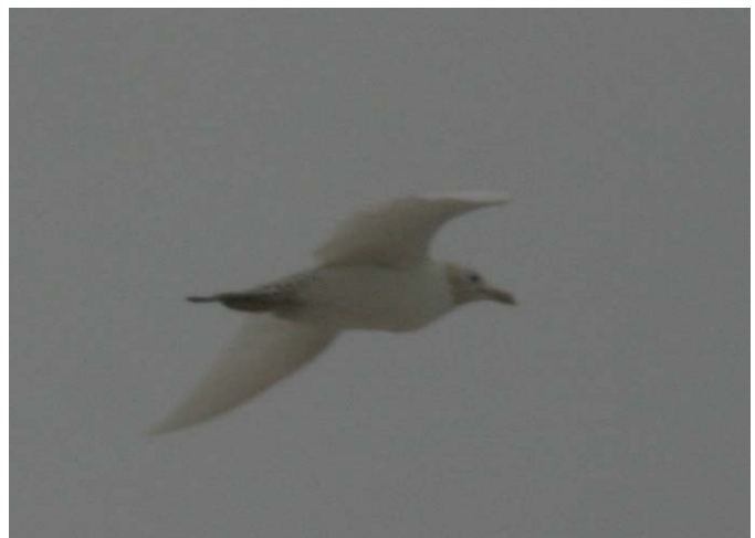
Partial albino Herring Gull at Mill Point (Ian Roberts)

Kingfishers were noted at Blackhouse Hill, Folkestone Harbour (2), and in the Botolph's Bridge / West Hythe area (2-3) and Grey Wagtails were at Beachborough Ponds, Sandling, and Brockhill CP (2). Stonechats were seen at Nickoll's Quarry, Samphire Hoe, and the Willop Outfall. There were some reasonable counts of winter thrushes including 50 Redwings and 65 Fieldfares at Blackhouse Hill on the 17 th and 100 Redwings at Postling Wents on the 31 st .