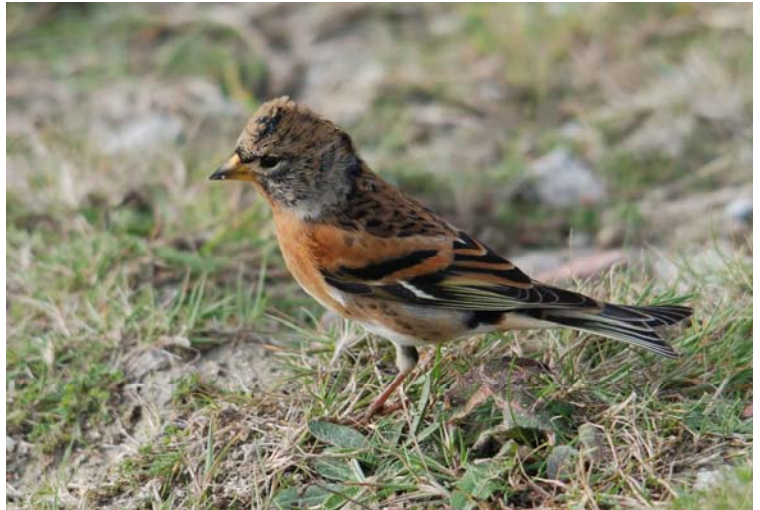
Brambling at Samphire Hoe

A light northerly on the 13 th produced another good selection of common migrants, including a Buzzard, a Firecrest, a Goldcrest, a Brambling, a Wheatear, up to 3 Ring Ouzels, 3 Blackcaps, 4 Black Redstarts, 7 Chiffchaffs, 9 Redwings and 15 Rock Pipits at Samphire Hoe and a Ring Ouzel, 2 Grey Wagtails, 3 Mistle Thrushes, 3 Song Thrush, 4 Chiffchaffs and 11 Stonechats at Abbotscliffe. A light north-easterly with drizzle on the 14 th produced a Great Grey Shrike , a Ring Ouzel, a Wheatear, a Goldcrest, 5 Redwings and 6 Song Thrushes at Abbotscliffe whilst 1,500 Starlings flew in off the sea and 2 Shelduck and 14 Brent Geese flew east there. A Ring Ouzel was at Samphire Hoe and a number of thrushes were heard moving over Hythe seafront pre-dawn.