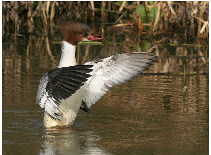
Goosander at Seabrook