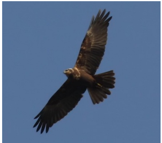
Marsh Harrier at Saltwood Castle (Brian Harper)

4 Buzzards were seen over the eastern end of Hythe Roughs on the 14 th , when another was at Saltwood Castle and a Peregrine flew over Hythe town, and a Marsh Harrier and 2 Buzzards were seen at Saltwood Castle on the 21 st . Single Water Rails were again recorded at Nickoll's Quarry and the canal at Seabrook. There were at least 130 Moorhens wintering in the area, including counts of 24 at Cinderella Farm (West Hythe), 21 at Seabrook and 19 at Scene Wood.