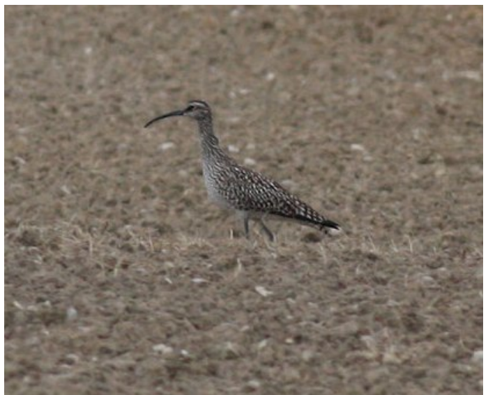
Whimbrel at Nickoll's Quarry