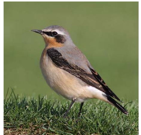
Buzzard and Cetti's Warbler at West Hythe and Wheatear at Hythe (Brian Harper)

A quieter few days followed but there was a further flush of migrants from the 10 th , when a Sedge Warbler and 2 Reed Warblers were at Botolph's Bridge, with a Lesser Whitethroat at the Gun Site on the 11 th and single Whitethroats there and at Hythe on the same day. Swallows and Willow Warblers continued to arrive in small numbers. A Merlin was seen along Donkey Street on the 12 th and migrant Marsh Harriers were noted at Botolph's Bridge on the 10 th , the Gun Site on the 11 th and Hythe on the 13 th . A Buzzard flew over Hythe on the 12 th (with another over Folkestone on the 16 th and 18 th ).