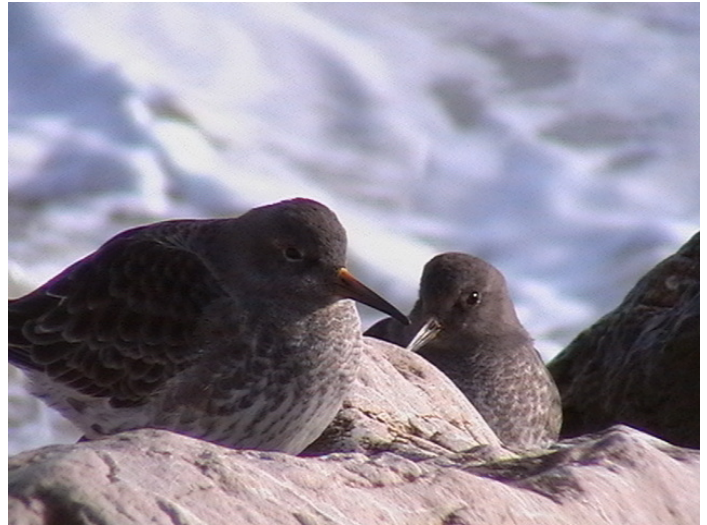
Purple Sandpipers at Hythe (Nick Hollands)

A Kingfisher was at Nickoll's Quarry on the 15 th , 42 Sky Larks were counted at Abbotscliffe on the 6 th and Grey Wagtails were seen at Saltwood Castle (3), Capel-le-Ferne (2) and Samphire Hoe. Winter thrush numbers were low, with the only report being 2 Redwings and 3 Fieldfares at Capel-le-Ferne on the 1 st .