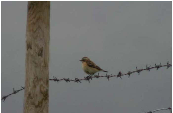
Whinchat at Blackhouse Hill (Ian Roberts)

The wind increased again on the 11 th , but this time from the north-east. It was just as quiet as before until an occluded front moved north across southern England on the 13 th , bringing some heavy and thundery rain (see weather chart below) and grounding some late migrants. It was an arrival more of quality than quantity, with singles of Spotted Flycatcher, Whinchat and Garden Warbler at Abbotscliffe and 2 Whinchats at Samphire Hoe on the 13 th , followed by a singing Icterine Warbler at the latter site the next morning. 3 Common Sandpipers were also at Folkestone Reservoirs on the 14 th and a Turtle Dove was at Barrowhill, Westenhanger. A Hobby was at Saltwood Castle on the 16 th .