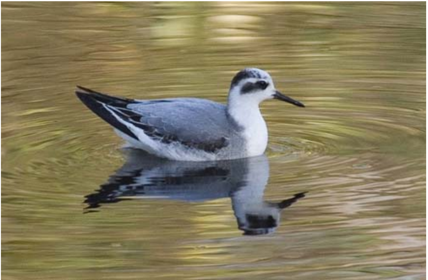
Grey Phalarope at West Hythe

After yet another night of wet and windy weather a Grey Phalarope was found on the canal at West Hythe on the 25 th . A Wigeon and 5 Curlew were at the Willop Outfall and a Tufted Duck and a Grey Wagtail were at Nickoll's Quarry. A Water Rail, a Kingfisher, a Firecrest, 2 Redpolls, 6 Siskins and 22 Redwings were at West Hythe the following day, and 2 Kingfishers, 2 Yellowhammers, 4 Fieldfares and 4 Redwings were in that area on the 27 th .