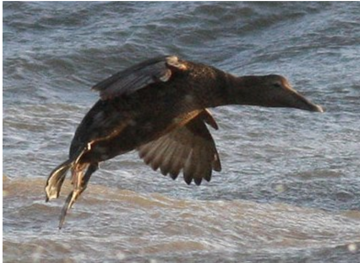
Eider at Hythe (Brian Harper)

Up to 9 Purple Sandpipers were in the Hythe area throughout, generally on the rocks opposite the Imperial or Stade Court Hotels. Ten Lapwings were at Capel-le-Ferne on the 1 st , a Curlew, 9 Sanderling and 30 Golden Plover were at the Willop Outfall on the 4 th , a Snipe was at Abbotscliffe on the 6 th , and a Green Sandpiper at Nickoll's Quarry on the 15 th completed the wader sightings in this period.