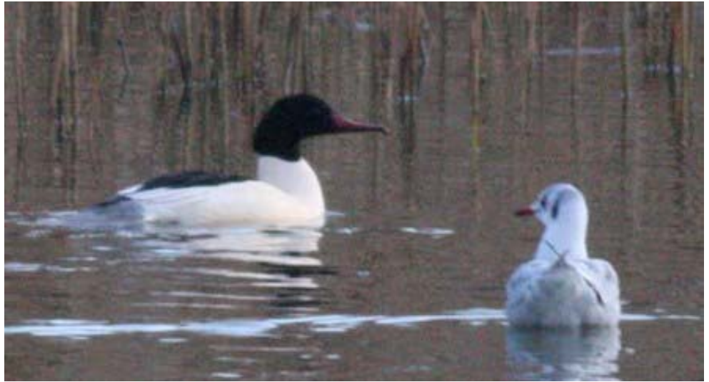
Goosander on the canal at Seabrook (Brian Harper)

Displaced wildfowl comprised 55 Wigeon at Nickoll's Quarry on the 19 th , when 25 flew west past Hythe, and Teal were on the Hythe Canal at Seabrook (4), Battery Point (3 east) and Hythe Roughs. Four Eider and 8 Common Scoters were also seen off Battery Point, Seabrook on the 19 th . The following day saw 2 Pintail and 12 Teal flying over Brockhill CP. Six Mandarins at Pedlinge on the 22 nd were local birds. On the 28 th a drake Goosander was on the Hythe Canal at Seabrook and 2 red-heads were at Nickoll's Quarry.