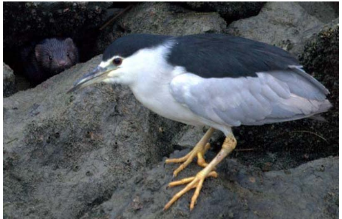
Night Heron and Mink at West Hythe

The severe frosts displaced a few Woodcock, with 1 at Nickoll's Quarry and at least 2 at Saltwood Castle on the 10 th (though one at Brockhill CP on the 1 st was at a more usual site) and brought a couple of Blackcaps