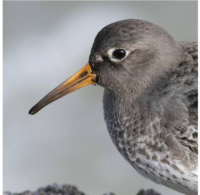
Purple Sandpiper at Hythe (Brian Harper)

A Cetti's Warbler was again along the canal at Seabrook on the 2 nd , a pair of Blackcaps frequented a garden in Folkestone in the first half of the month, a Chiffchaff was at Westenhanger on the 25 th and 2 Firecrests were wintering at Sandgate (Enbrook Park). A Marsh Tit was at Scene Wood on the 18 th but this was the only record from this winter.