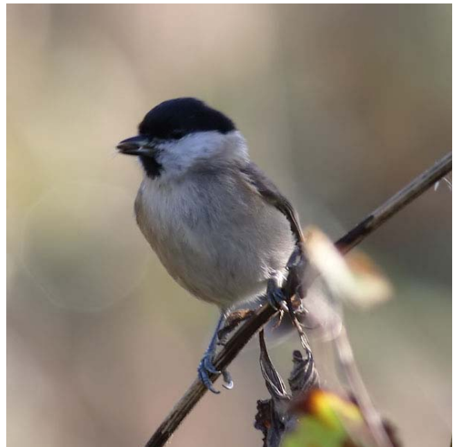
Firecrest and Marsh Tit at West Hythe (Brian Harper)

A Little Grebe, a Wigeon, a Blackcap, 3 Chiffchaffs and a Reed Bunting were at Samphire Hoe on the 27 th , whilst a Buzzard flew in off the sea there and a Great Skua was brought in and released by a vet. A Ring Ouzel and 2 Fieldfares were in the trees behind Capel-le-Ferne Café and a Little Egret and a Grey Wagtail flew west. On the 28 th a Corn Bunting was at Abbotscliffe and a Siskin, 4 Collared Doves, 5 Redpolls, 8 Stock Doves, 20 Wood Pigeons and 50 Redwings flew over. The next day saw a Grey Wagtail, a Siskin, 2 Redwings, 2 Redpolls, 2 Reed Buntings, 6 Snipe and 9 Grey Partridges at Abbotscliffe and 3 Firecrests behind Capel-le-Ferne Café.