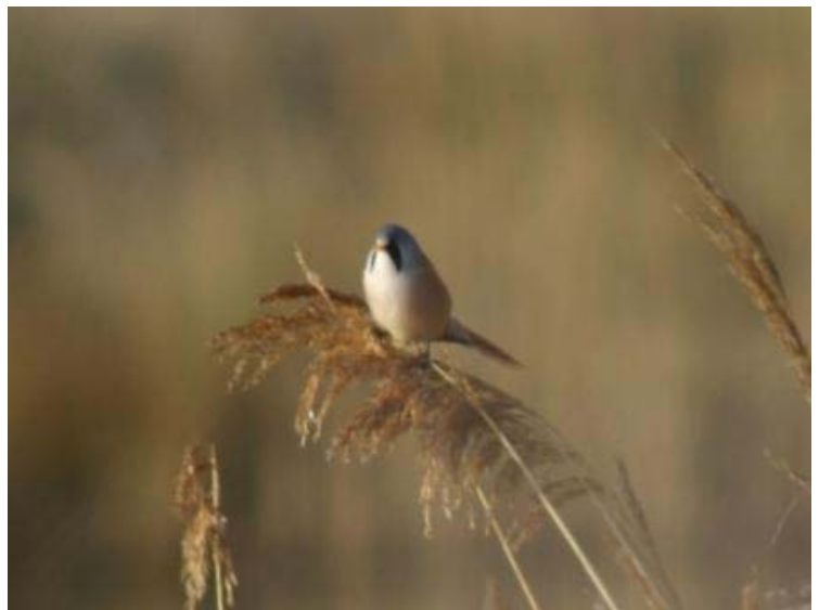
Bearded Tit at Nickoll's Quarry (Ian Roberts)

Chaffinches were on the move again on the 19 th , when 2,135 were logged heading in/east over Abbotscliffe, accompanied by 2 Bramblings, 118 Siskins and a small but unusual passage comprising a Coal Tit, 2 Long-tailed Tits, 3 Great Tits and 4 Blue Tits. Three Chiffchaffs were along the Hythe Canal at Seabrook the following day and records were almost daily thereafter. Two 'continental' Coal Tits were at Capel-le-Ferne on the 21 st and a further 2 were at Samphire Hoe the next day.