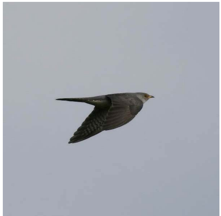
Cuckoo at Botolph's Bridge (Brian Harper)

Buzzards continue to increase locally and there were sightings in May from Blackhouse Hill (Hythe), Saltwood Castle, the Westenhanger area, Folkestone town (up to 3) and West Hythe (up to 4).