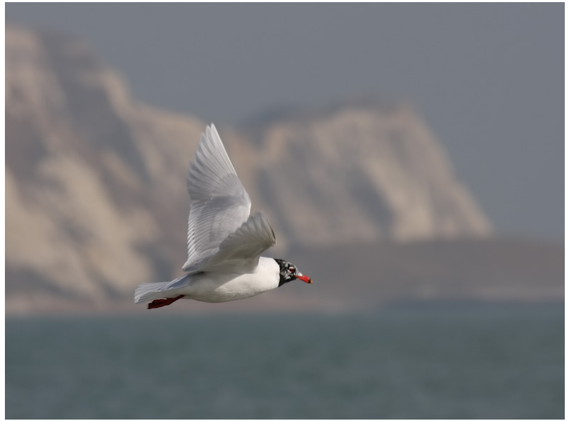
Great Crested Grebe in Folkestone Harbour and Mediterranean Gull at Copt Point (Brian Harper)

A male Bearded Tit at Nickoll's Quarry on the 16 th was a good local record and a Tufted Duck, 2 Teal and another Chiffchaff were noted there. The following day saw another large movement of Chaffinches, with 1,545 over Abbotscliffe, and 2 Bramblings, 3 Stock Doves, 38 Siskins, and 170 Starlings also flew in/east there. A Little Egret was at Samphire Hoe on the 18 th (with presumably the same bird at Abbotscliffe on the 21 st ).